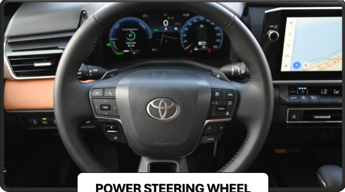
POWER STEERING WHEEL