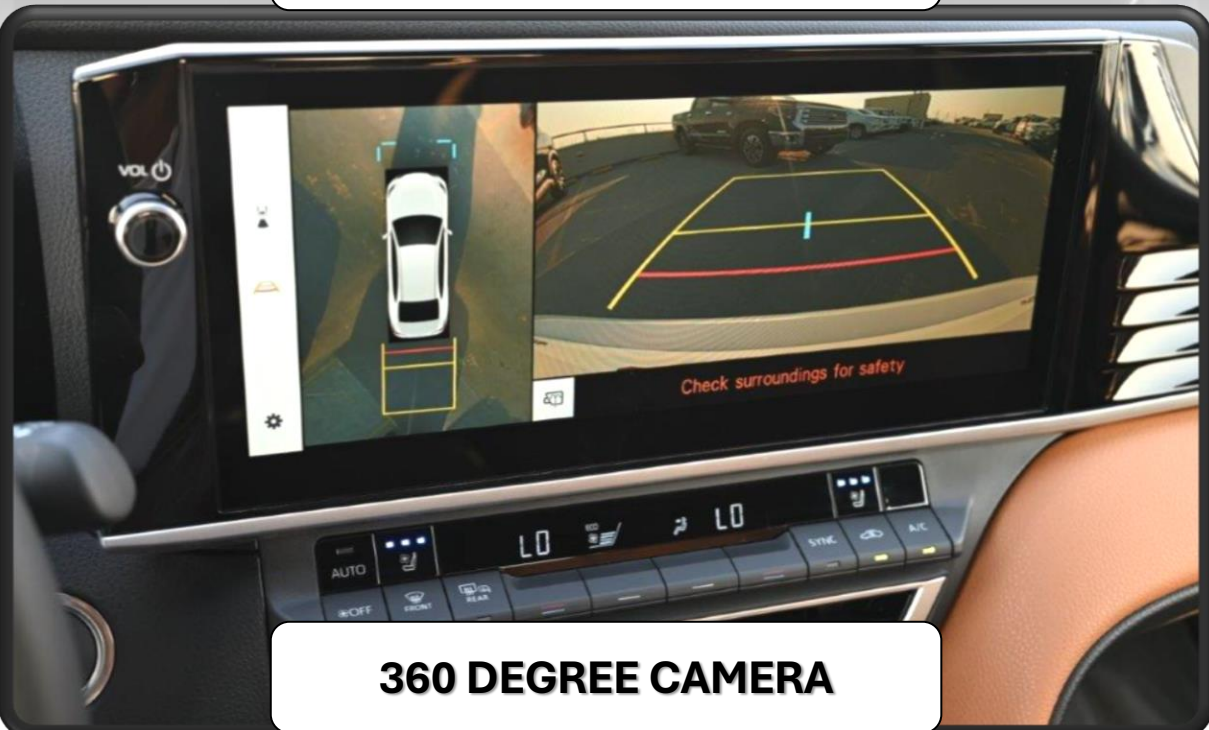
360 DEGREE CAMERA